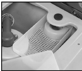
An integrated debris catch cage traps and collects drain clogging debris.