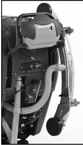
A built-in squeegee hanger makes transport easier and reduces trip and fall accidents.