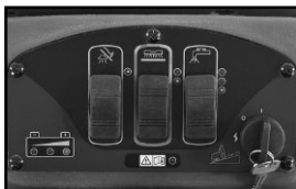
The SC 750 ST model – provides simple operation and robust scrubbing controls.