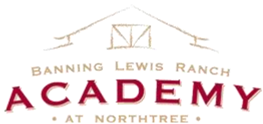
Banning Lewis Ranch Academy