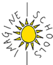
Imagine Classical Academy