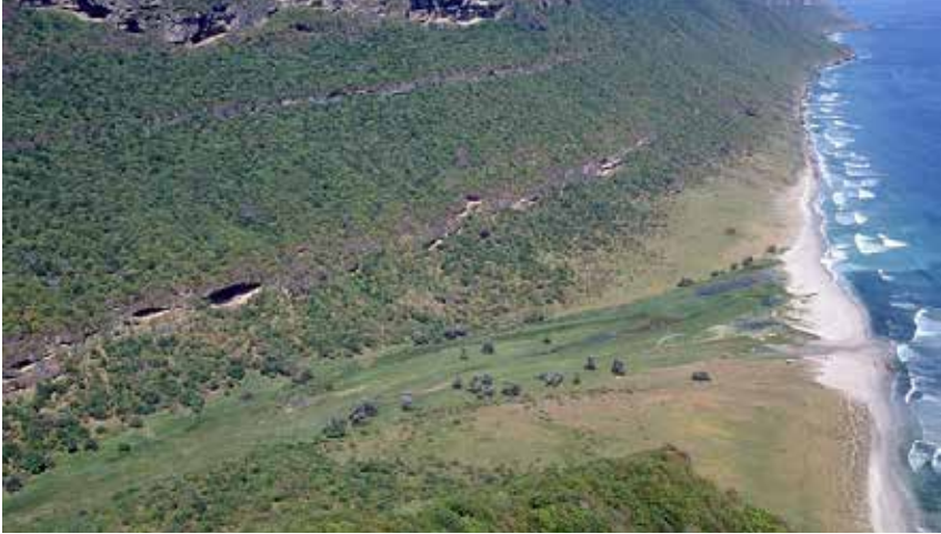
A view of Khor Kharfot at Wadi Sayq, facing eastward. Photo taken after the monsoon season when the area is especially green.

In contrast to Joseph's vague summary of Lehi's journey mentioned above, the Book of Mormon text provides a number of specific details: three days through the wilderness past the borders "nearer" the Red Sea to the Valley of Lemuel, which has a continuously flowing river, and