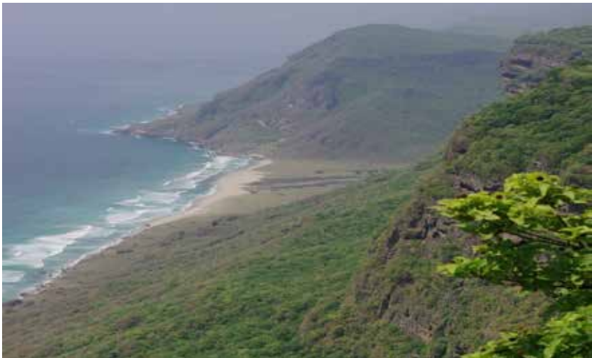
A view of Khor Kharfot, the mouth of Wadi Sayq, a leading candidate for Bountiful, with Arabia's largest freshwater lagoon and abundant fruit, nearly due east of Nahom.

Contrary to all previous reports, a perennial stream was found by George Potter and Craig Thorsted that flows through a magnificent canyon into "the fountain of the Red Sea," in a place that nicely fits