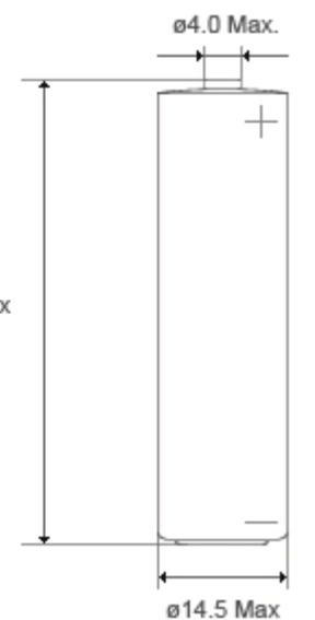
Dimensions in mm