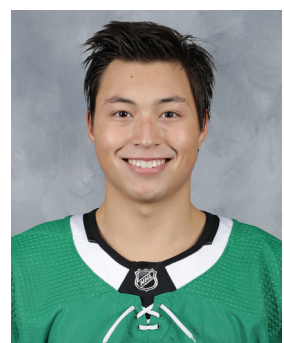
JASON ROBERTSON #18