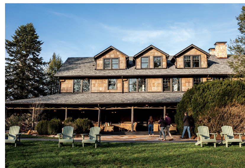
From the boutique charm of Hotel Cashiers (opposite top right, and below left) to the upscale amenities of the resort at High Hampton (opposite left and below right; this page, left and below), you'll find a refreshing getaway in Cashiers, North Carolina.