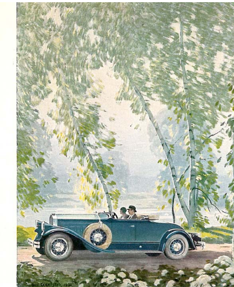
Many Spring seasons and many Pierce-Arrows have passed between the two portraits by Chichester on this page... but the season brings back the same fresh beauty in the scene each year, and the car continues to be America's finest motor car.

The stock market crash of 1929 marked the end of the “Roaring Twenties” and the “Great Depression” soon followed. Pierce-Arrow, like other luxury car manufacturers, struggled yet forged ahead during this period. Pierce-Arrow’s sales had hit a record high in 1929 of nearly 10,000 autos, but had fallen to only a little more than 4,500 by 1931. While the company offered an improved version of its eight-cylinder engine for 1931, its V-12 engine would not become available until 1932.