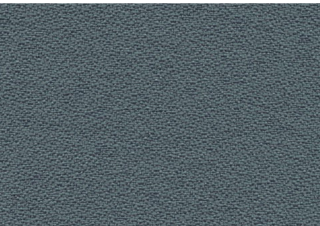
Gray - 91