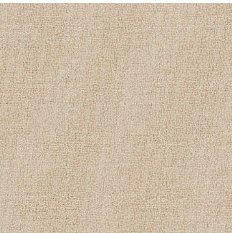
Beige - 90