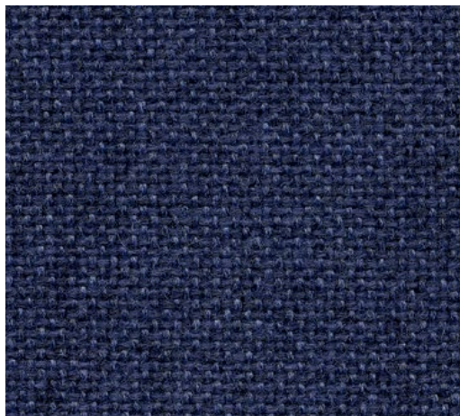
Blue - 93