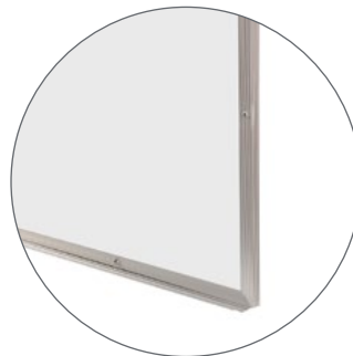
Anodized Aluminum Satin Frame - No Marker Tray