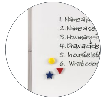
Scratch and Stain Resistant Surface that Accepts Magnets