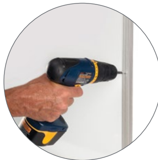
Factory-Drilled Holes for Quick Mounting