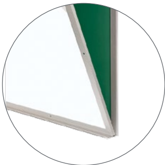
Fits over Existing Framed Boards for Quick and Easy Installations