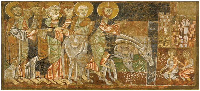
Entry of Jesus into Jerusalem, fresco transferred to canvas from the hermitage of St. Baudelius of Berlanga (Soria), Indianapolis Museum of Art.

— T. F. Torrance, Incarnation: The Person and Life of Christ