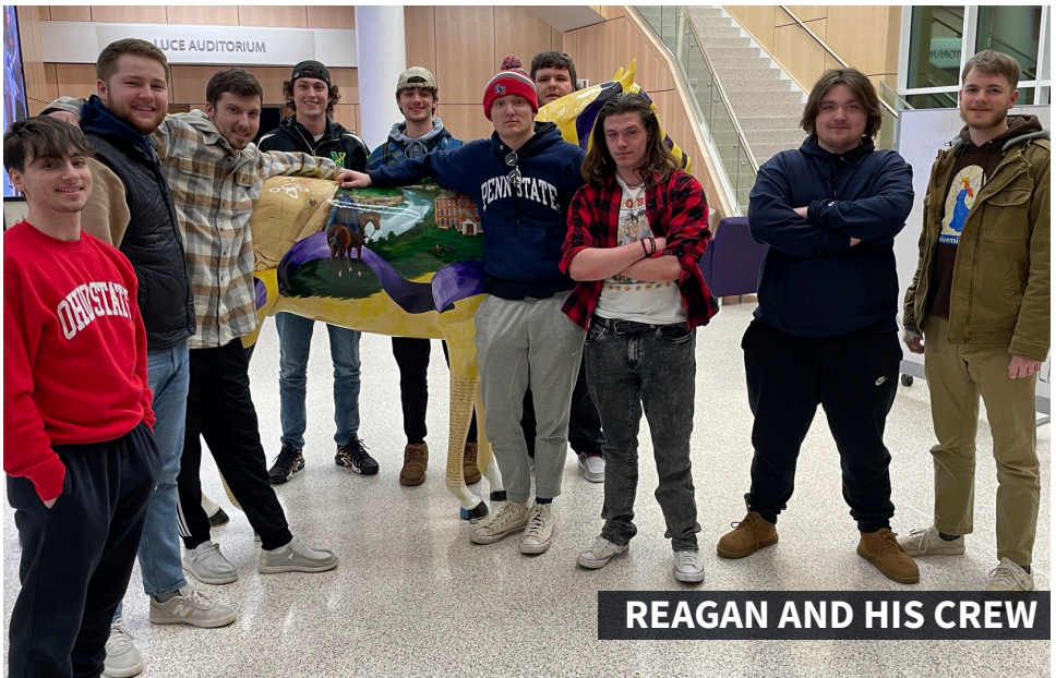
REAGAN AND HIS CREW