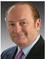
Robert C. Merton | School of Management Distinguished Professor of Finance, MIT Sloan School of Management