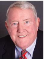
E. Gerald Corrigan | Managing Director, Goldman Sachs & Co.