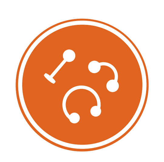
PIERCINGS & TATTOOS Align to company culture or standards