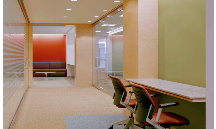
Interior, exec break out area