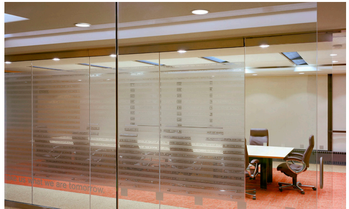
Interior, conference room