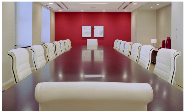
Interior, conference room