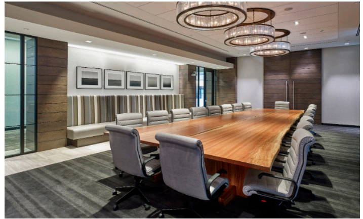
Interior, meeting room

Franklin Square Investments, a leading manager of alternative investment funds was growing rapidly and out grown their existing facility. The headquarters relocation to a new build to suit facility at the Philadelphia Navy Yard provided the opportunity to create a workplace that reflected the FSI brand and culture where there is a strong emphasis on performance and wellness. In lieu of private offices, each employee has a sit-to-stand workstation with seated privacy to provide a level of privacy for individual focused work with easy access to enclosed huddle and meeting rooms. The design, full of natural light and transparency to enclosed spaces, promotes interaction and provides a collaborative and healthy environment. A communal 'town center' on each floor provides a gathering area for impromptu gatherings, idea sharing and a spot to decompress. The emphasis on wellness is supported by a multi-use exercise facility, personal trainers and a cafeteria with a nutritionist as head chef.