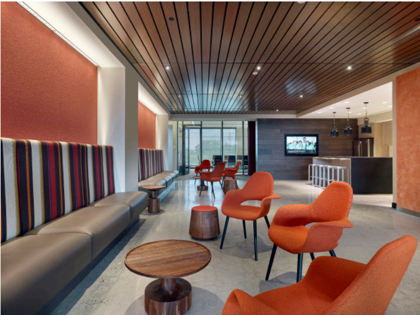
Interior, café lounge