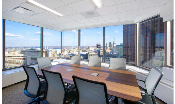
Interior, meeting room