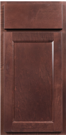
Harvest Brown Stain