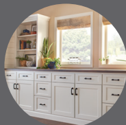
Kitchen & Bath

Find us on Instagram @ wolfhomeproducts for inspiration on your next project!