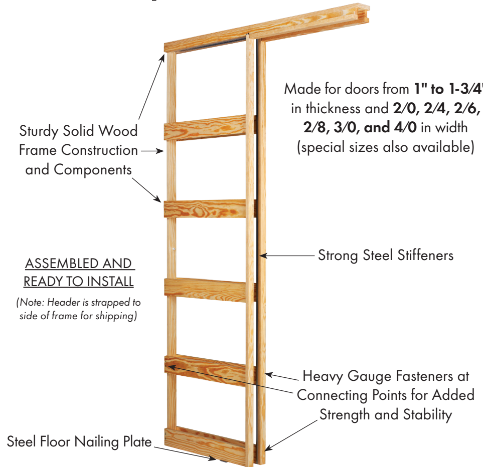
Dimensions of Rough Openings for Door Frames: