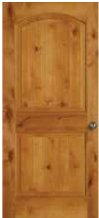
7465 KNOTTY ALDER V-Groove Panel