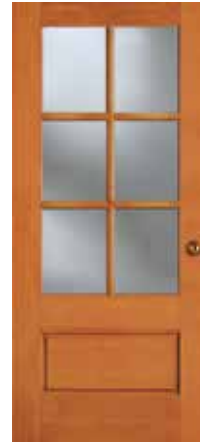
506 2'6", 2'8", 3'0" x 6'8" 2'6", 2'8", 3'0" x 8'0"