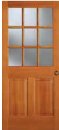
944 2'8", 3'0" x 6'8"