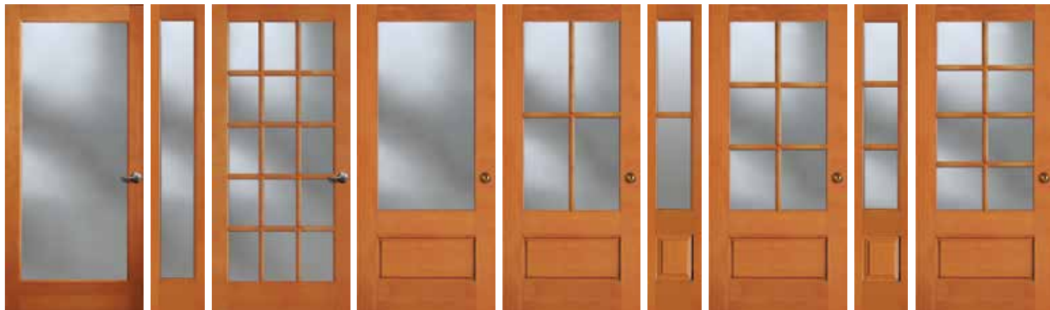
7001 2'0", 2'6", 2'8", 3'0" x 6'8" 7701 1'0" x 6'8" 2'6", 2'8", 3'0" x 6'8" 7015 3'0" x 6'8" 7504 3'0" x 6'8" 7802 1'0" x 6'8" 2'6", 2'8", 3'0" x 6'8" 7506 1'0" x 6'8" 3'0" x 6'8" 7803 3'0" x 6'8" 7508 Low-E glass

All in stock Thermal Series doors are offered 1 \frac{3}{4} " thick with \frac{3}{4} " insulated glazing, 1 \frac{7}{16} " Innerbond® double hip-raised panels and UltraBlock® technology, which means a 5-year warranty. Doors are offered in Douglas Fir and 3'0" x 6'8" unless otherwise noted. Sidelights are offered in Douglas Fir and 1'0" x 6'8" unless otherwise noted. For additional designs, sizes and wood species, contact your Dyke representative to special order.