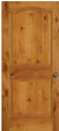
465 KNOTTY ALDER 1'6", 2'0", 2'4", 2'6", 2'8", 3'0" x 6'8"

All in stock Interior Doors are offered 1 \frac{3}{8} " thick with \frac{3}{4} " thick double hip-raised panels and carry a 10-year warranty. For additional designs, sizes and wood species, contact your Dyke representative to special order.