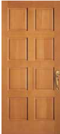
2010 3'0" x 6'8"