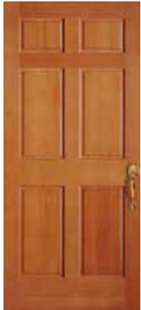
2130 2'8", 3'0" x 6'8"

All in stock Traditional Series doors are offered 1 \frac{3}{4} " thick with \frac{5}{8} " single glazing and UltraBlock® technology, which means a 5-year warranty. Doors are offered in Douglas Fir and 3'0" x 6'8" unless otherwise noted. For additional designs, sizes and wood species, contact your Dyke representative to special order.