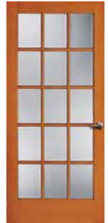
1515 2'6", 2'8", 3'0" x 6'8"