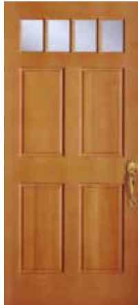
2134 3'0" x 6'8"