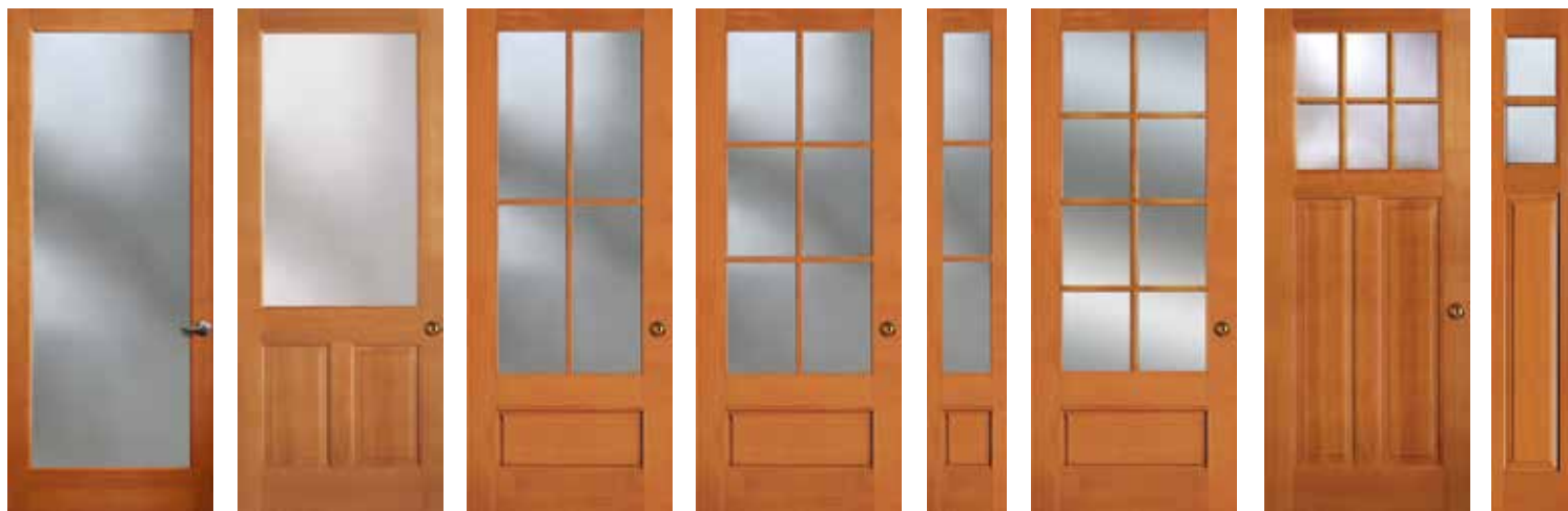
7001 2'6", 2'8", 3'0" x 8'0" 7044 2'8", 3'0" x 8'0" 7504 2'8", 3'0" x 8'0" 7506 2'6", 2'8", 3'0", 3'6" x 8'0" 7803 1'0" x 8'0" 7508 2'8", 3'0" x 8'0" 7662 3'0" x 8'0" 7663 1'0" x 8'0"

ALL STOCK FIR DOORS ARE 1/4" UNDER IN WIDTH AND 1" UNDER IN HEIGHT