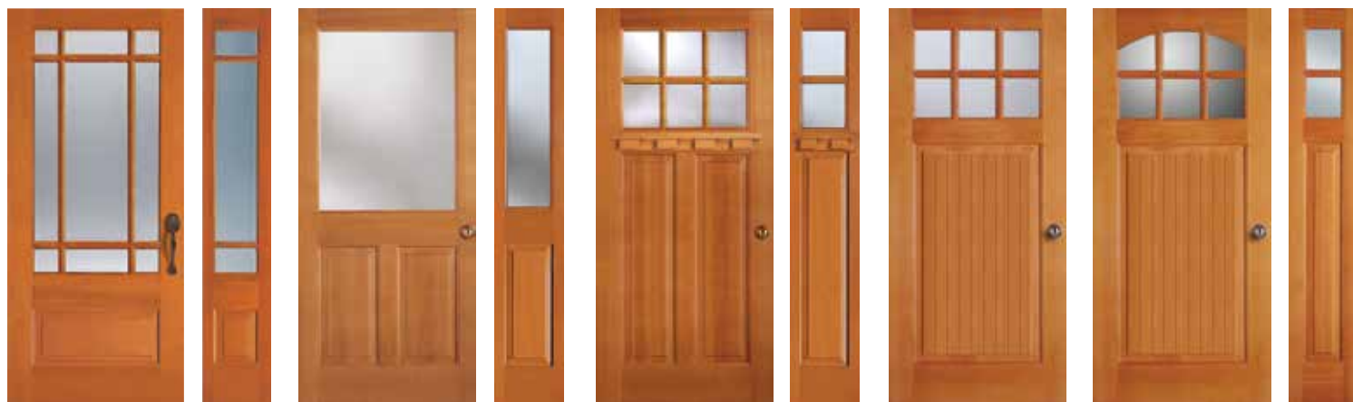
7598 BELLAIRE® 3'0" x 6'8" 7599 1'0" x 6'8" 7044 2'8", 3'0" x 6'8" 7702 1'0" x 6'8" 7662 3'0" x 6'8" 7663 1'0" x 6'8" 7228 3'0" x 6'8" 7218 3'0" x 6'8" 7219 1'0" x 6'8" Optional 9541 Dentil Shelf 7663 Sidelight with Optional 9510 Dentil Shelf