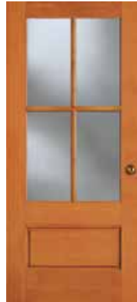
504 2'6", 2'8", 3'0" x 6'8" 2'6", 2'8", 3'0" x 8'0"