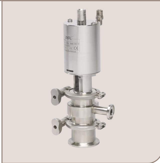
Unique 7000 Vacuum Breaker Valve

During CIP, a pneumatic actuator is used (pulsed) to force the ball off the upper seat, allowing cleaning of the seat and the internals of the vacuum breaker valve. The CIP fluid discharged during the actuator pulse is ushered to drain via the vent port (see fig. 2c).