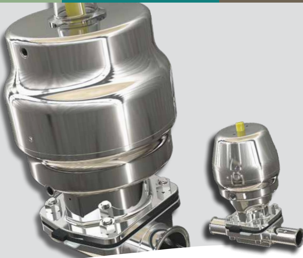
Saunders ® S360 Actuator DN8-DN100 (0.25" to 4.00")