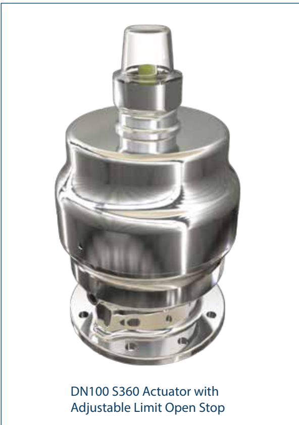
DN100 S360 Actuator with Adjustable Limit Open Stop