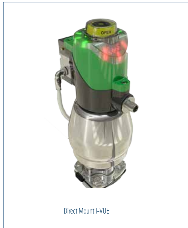
Direct Mount I-VUE

Visit www.saundersS360.com for additional information on other Saunders ® products, including technical datasheets, drawing library, and product selection tools.