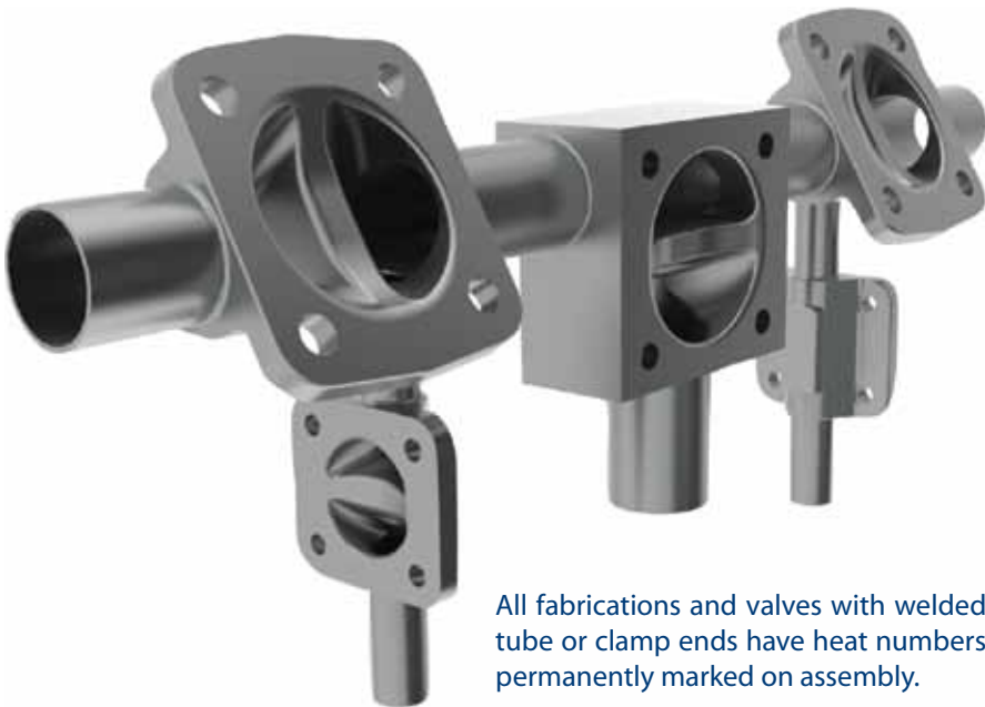
All fabrications and valves with welded tube or clamp ends have heat numbers permanently marked on assembly.