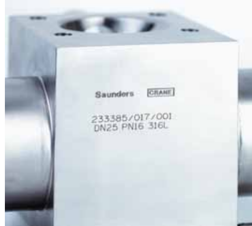
Machined from block bodies are marked in suitable location on block.

Saunders® full portfolio of drawing data can be accessed at www.saundersdrawings.com in both 2D and 3D file format.