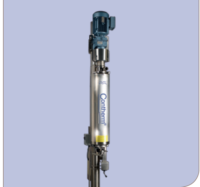
Contherm SSHE model 6x6

Product enters the cylinder through the lower product head and flows upwards through the cylinder. At the same time, the heating/cooling media travels in counter-current flow through the narrow annular channel between the heat transfer wall and the insulated jacket.