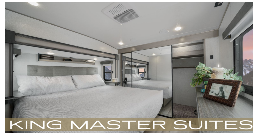
KING MASTER SUITES