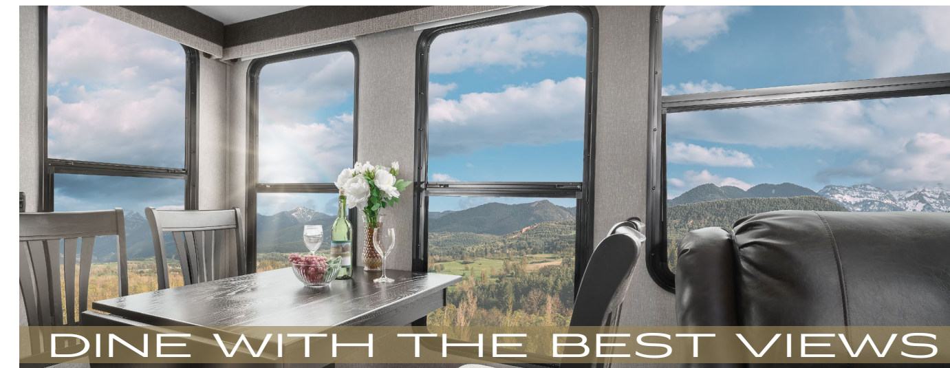
DINE WITH THE BEST VIEWS