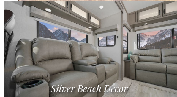
Silver Beach Decor