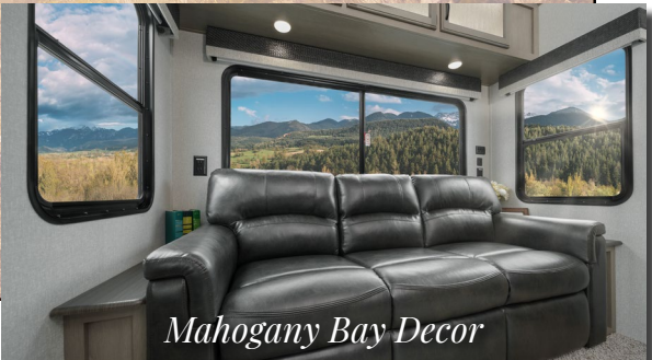
Mahogany Bay Decor