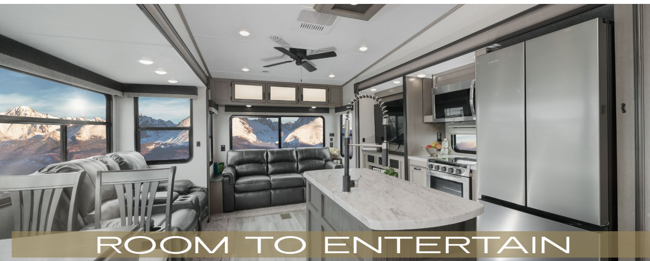
ROOM TO ENTERTAIN