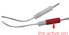
the active pin

NOTE: Both of the lead wires should run through the black "wire channel" on the inner side of the brace. When complete both wire plugs can be tucked or stuffed into the wire channel as much as possible.