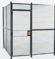
FENCING & MACHINE GUARDING