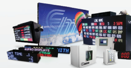
INDUSTRIAL LED DISPLAYS & STANDALONE ANDON SYSTEMS