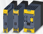
SAFETY CONTACTORS & RELAYS