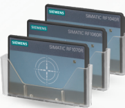
RFID CARD READERS