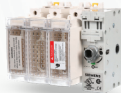
ENCLOSED ROTARY DISCONNECTS