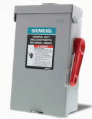
ENCLOSED KNIFE SAFETY DISCONNECTS