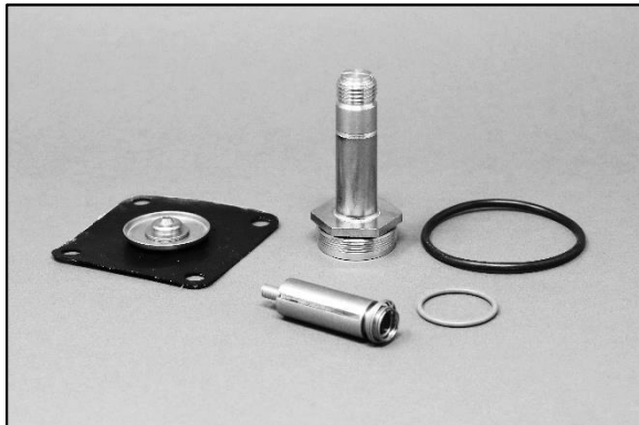
Typical Diaphragm Valve Rebuild Kit