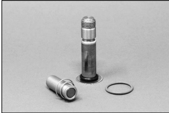
Typical Direct Acting Valve Rebuild Kit