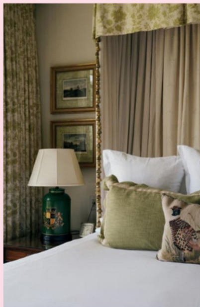
Artful dishes are matched only by the farm’s sumptuous lodging.

Dinner dishes are less traditional but still have Southern twists: brown butter-basted salmon with corn butter and maitake mushrooms, and sheep’s milk cheesecake with hazelnut crumble and peaches.