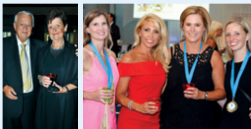
Turnstone's 16th Annual Board of Directors' Gala at the new Plassman Athletic Center was another unqualified success, raising more than $385,000. Thanks to all. See more Gala photos at turnstone.org/gala .