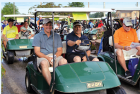
Golfers prepare to hit the course at Turnstone's 6th JERK Invitational Golf Outing. This year's outing raised more than $24,000 for Turnstone.

On Saturday, August 15, Turnstone joined the JERK League for our Annual Golf Outing. No, they aren't jerks, just a fun league dedicated to giving back to Turnstone while enjoying one of America's favorite pastimes. More than 140 golfers played in this year's outing, and along with event sponsors and donors, raised more than $24,000. A huge thank you to the event sponsors, auction donors, players, and volunteers for making this year's outing a hit!