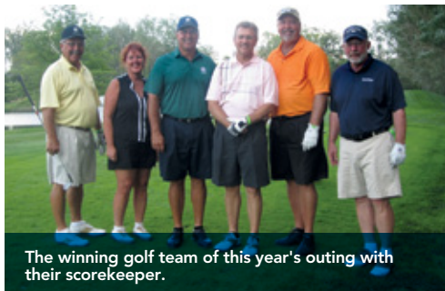
The winning golf team of this year's outing with their scorekeeper.