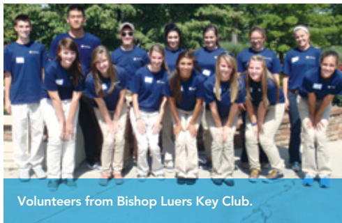
Volunteers from Bishop Luers Key Club.

their generous in-kind donations. We also extend our thanks to the event sponsors, auction donors, players, and golf committee and volunteers for making this year's outing a success. Mark your calendars for our 2013 outing on September 12 at Autumn Ridge.