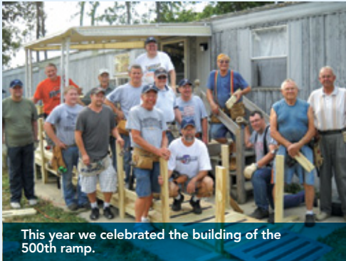
This year we celebrated the building of the 500th ramp.