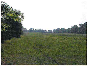
Item 1 of 2 2 Images / 0 Sketches

Property Owner: ADAMS CHARLES W II & KARRE LYN