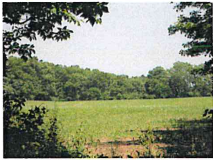
Item 1 of 2 2 Images / 0 Sketches

Property Owner: ADAMS CHARLES W II & KARRE LYN