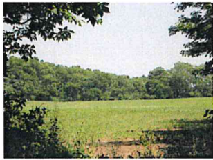
Item 1 of 2 2 Images / 0 Sketches

Property Owner: ADAMS CHARLES W II & KARRE LYN