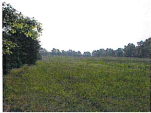
Item 1 of 2 2 Images / 0 Sketches

Property Owner: ADAMS CHARLES W II & KARRE LYN