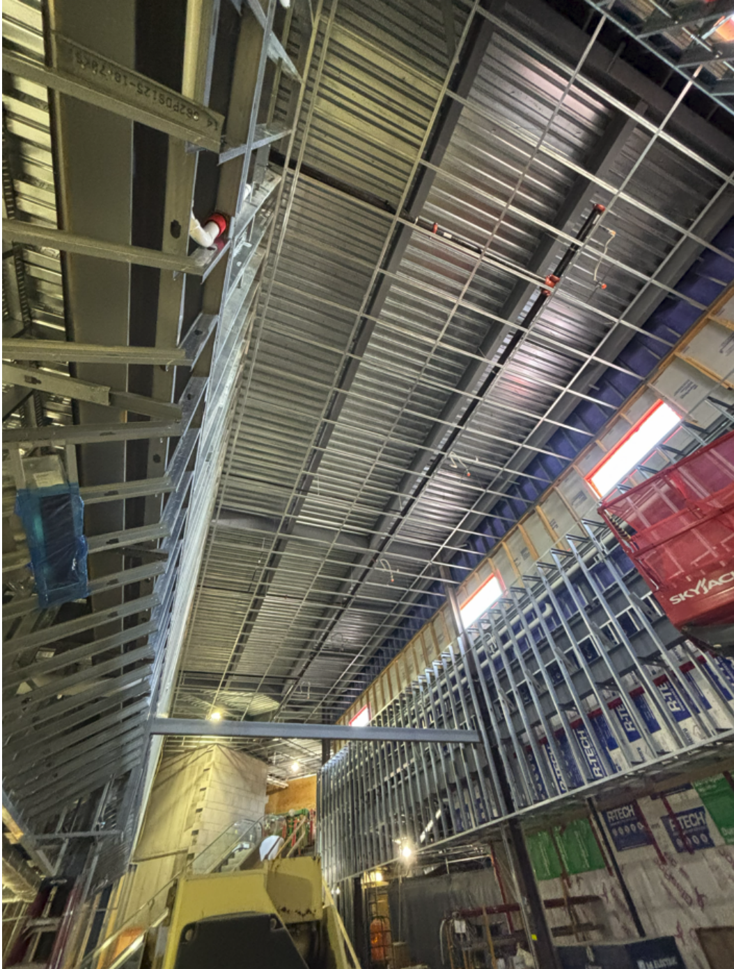
Ceiling structure before drywall was installed