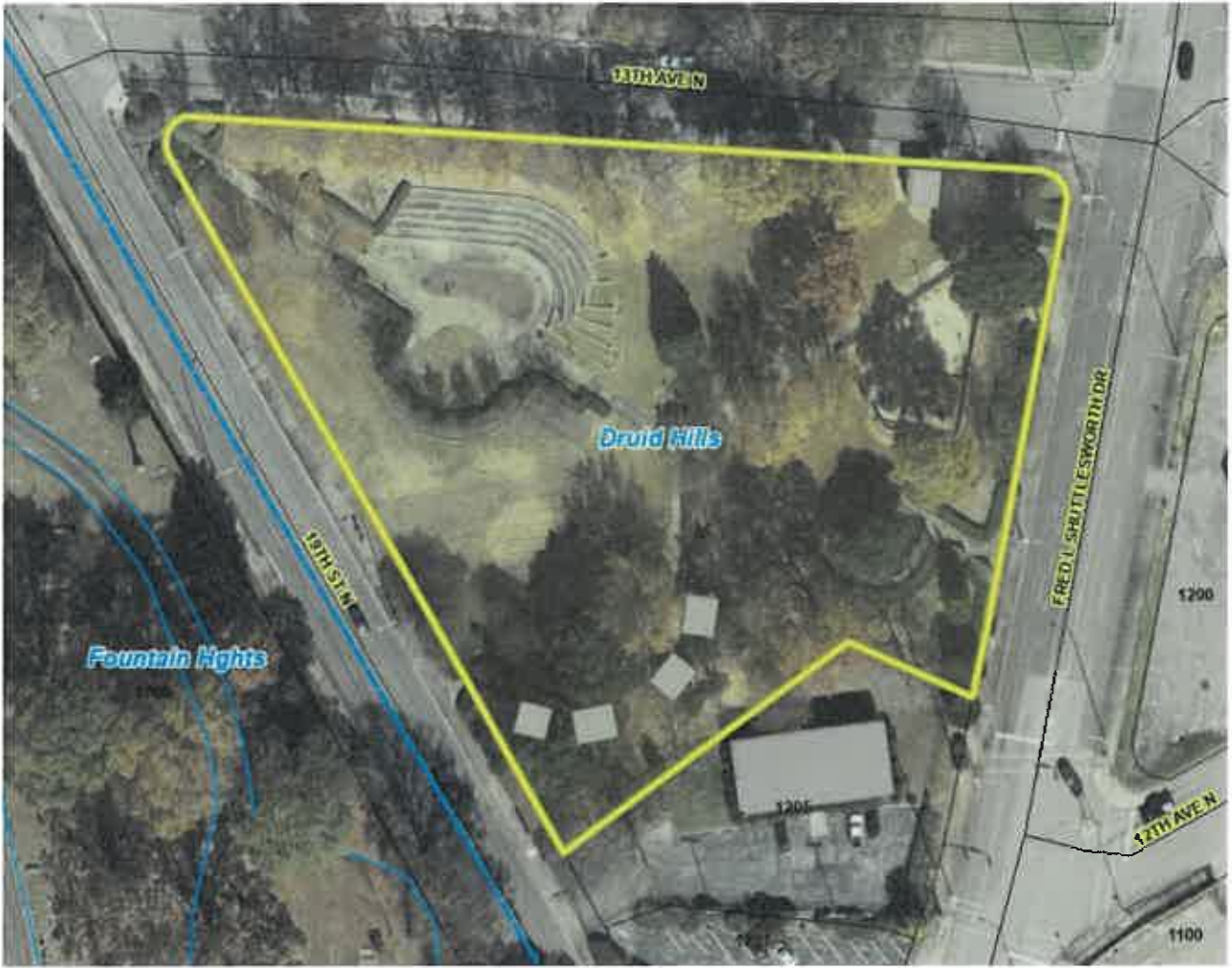
ARTHUR SHORES PARK