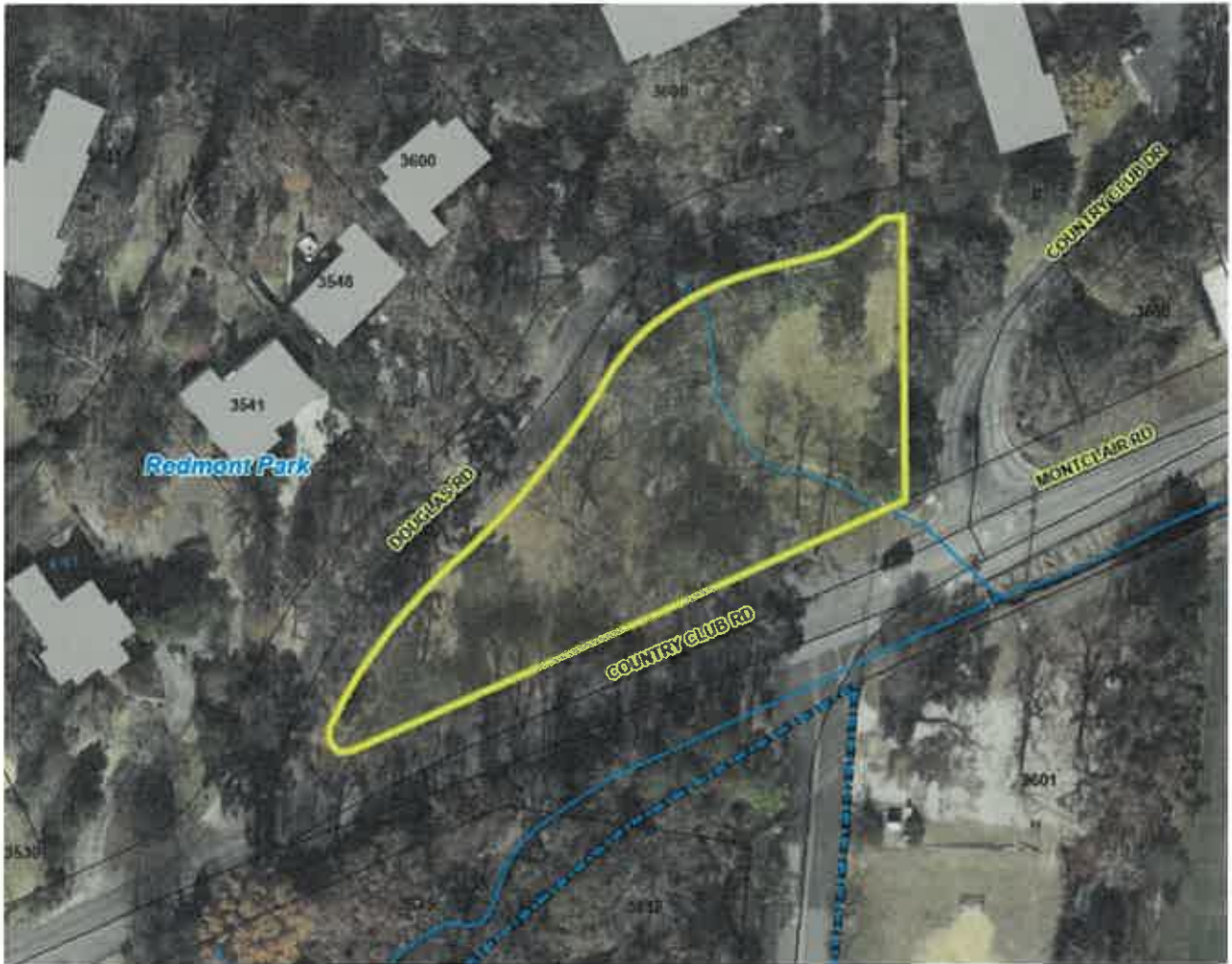
RAMSAY PARK 1-A