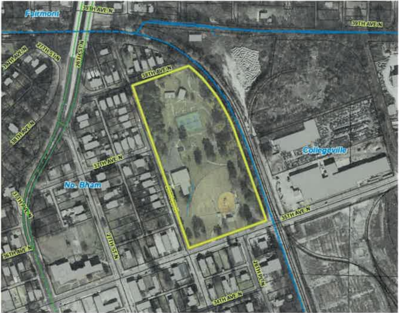
NORTH BIRMINGHAM PARK (EXCLUDES BALLFIELD)