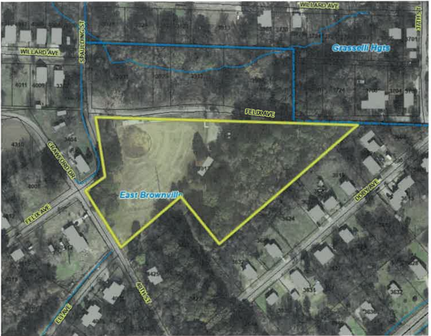
EAST BROWNVILLE PARK (EXCLUDING BALLFIELD)