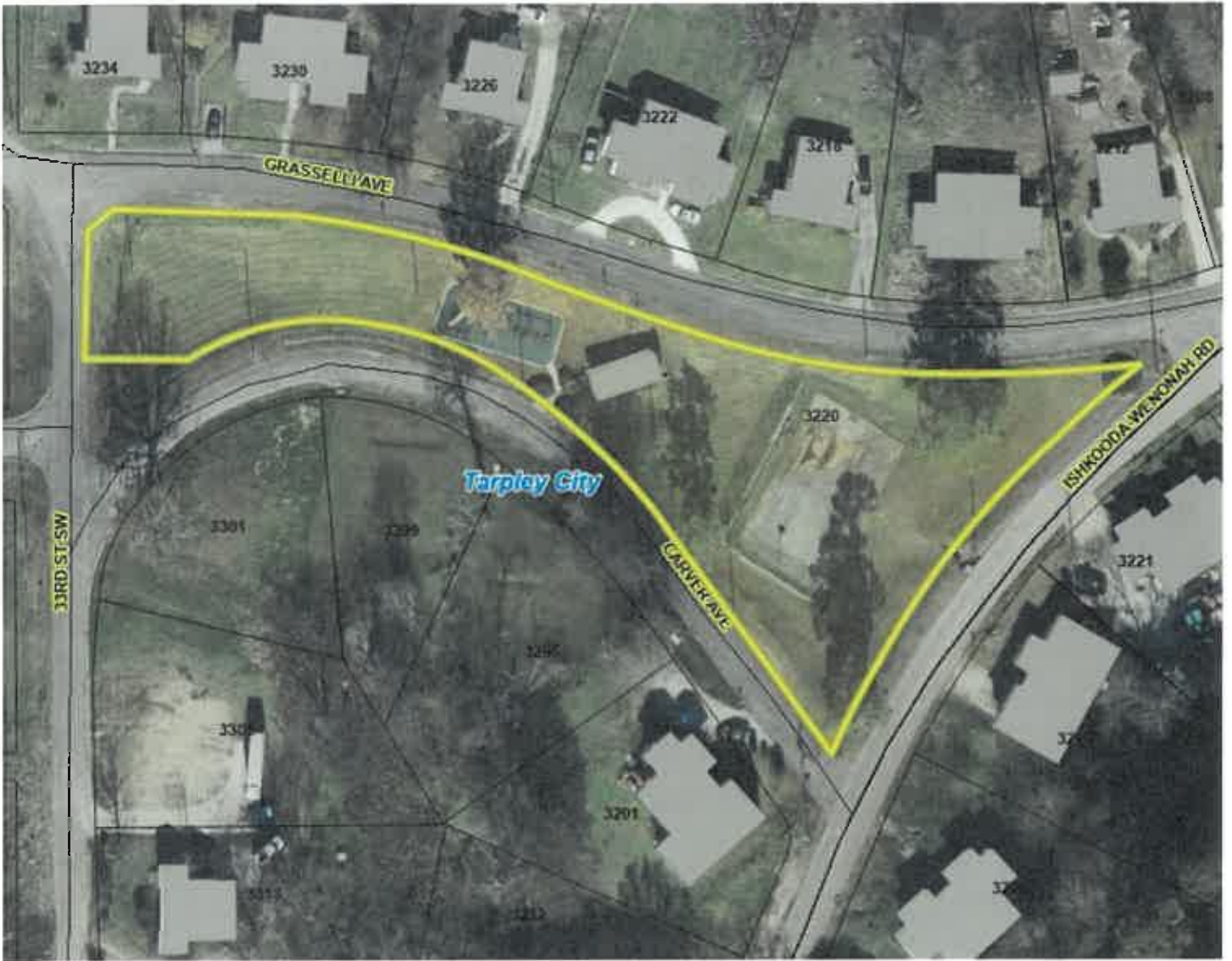
TARPLEY CITY PARK