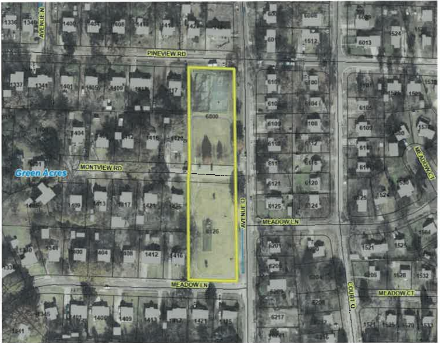
ROZELLE REYNOLDS-GREEN ACRES 1 PARK