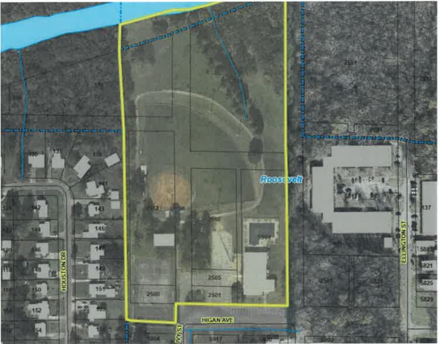
ROOSEVELT CITY PARK (EXCLUDING BALLFIELD)