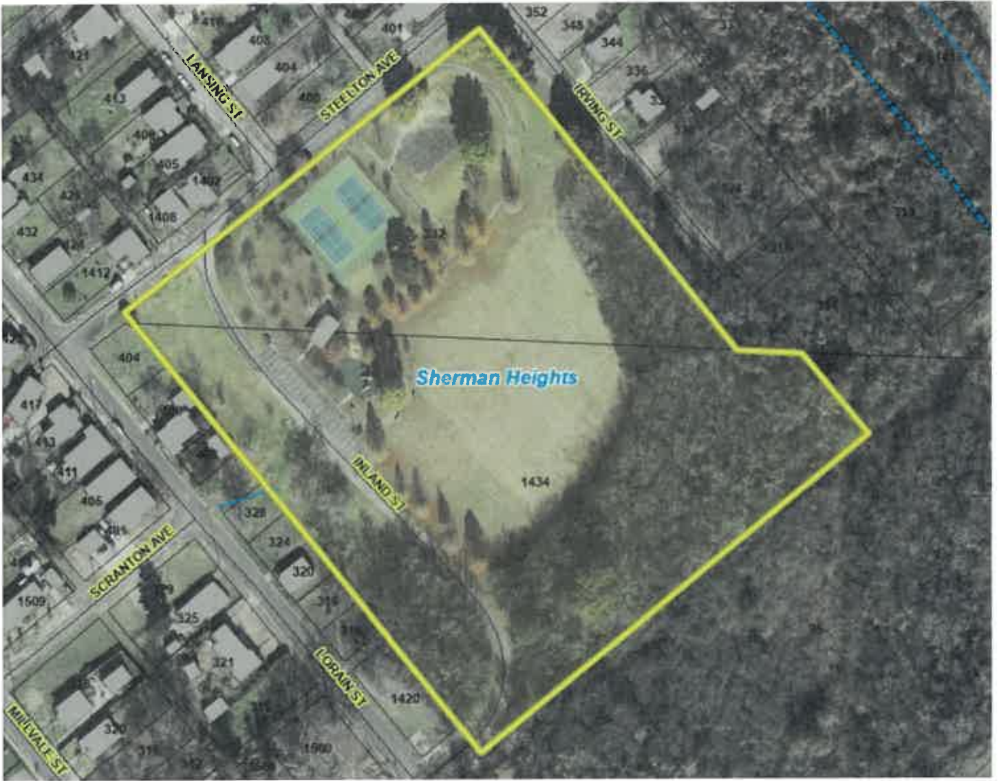
SHERMAN HEIGHTS NORTH PARK