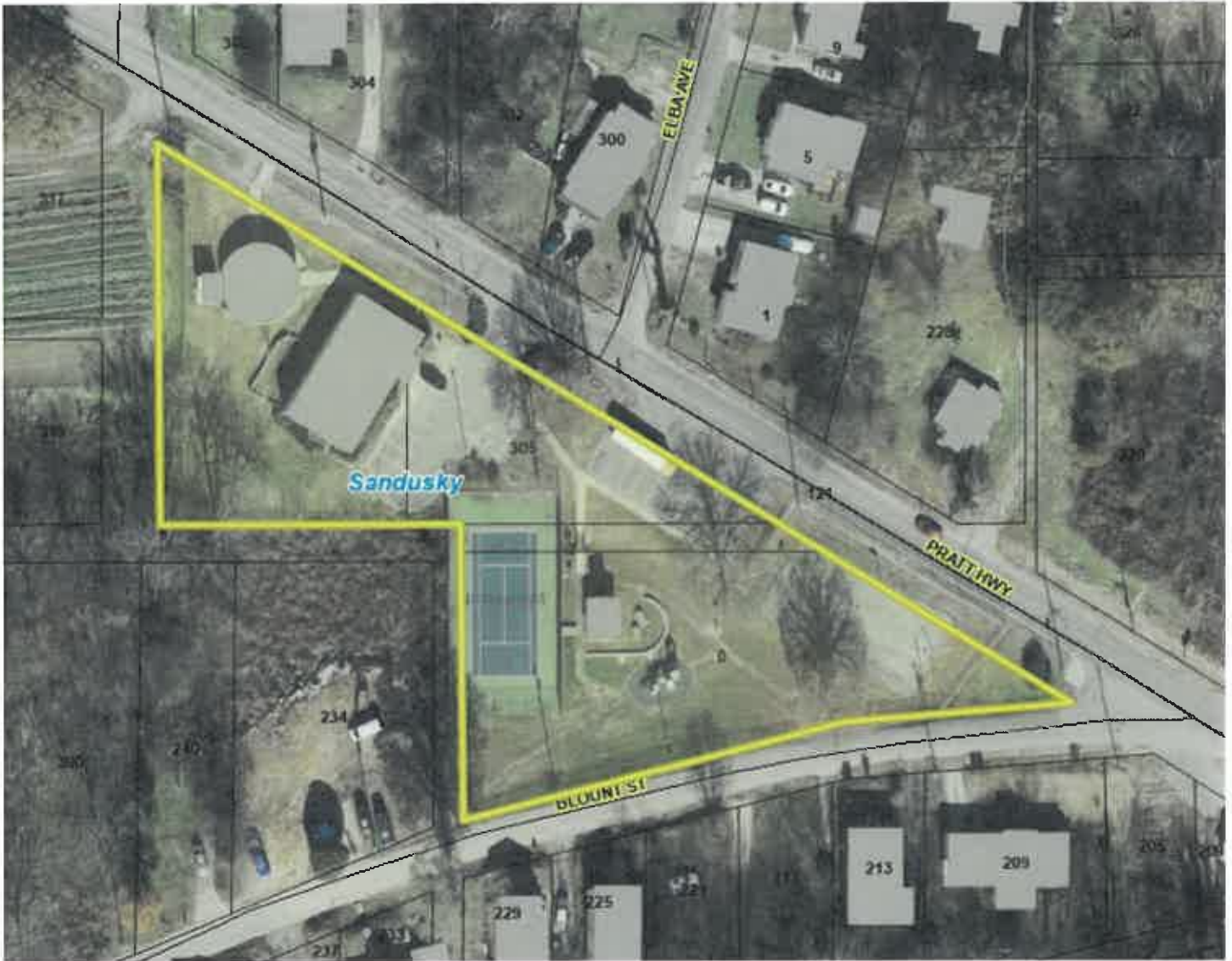
JIMMIE HUDSON-SANDUSKY PARK