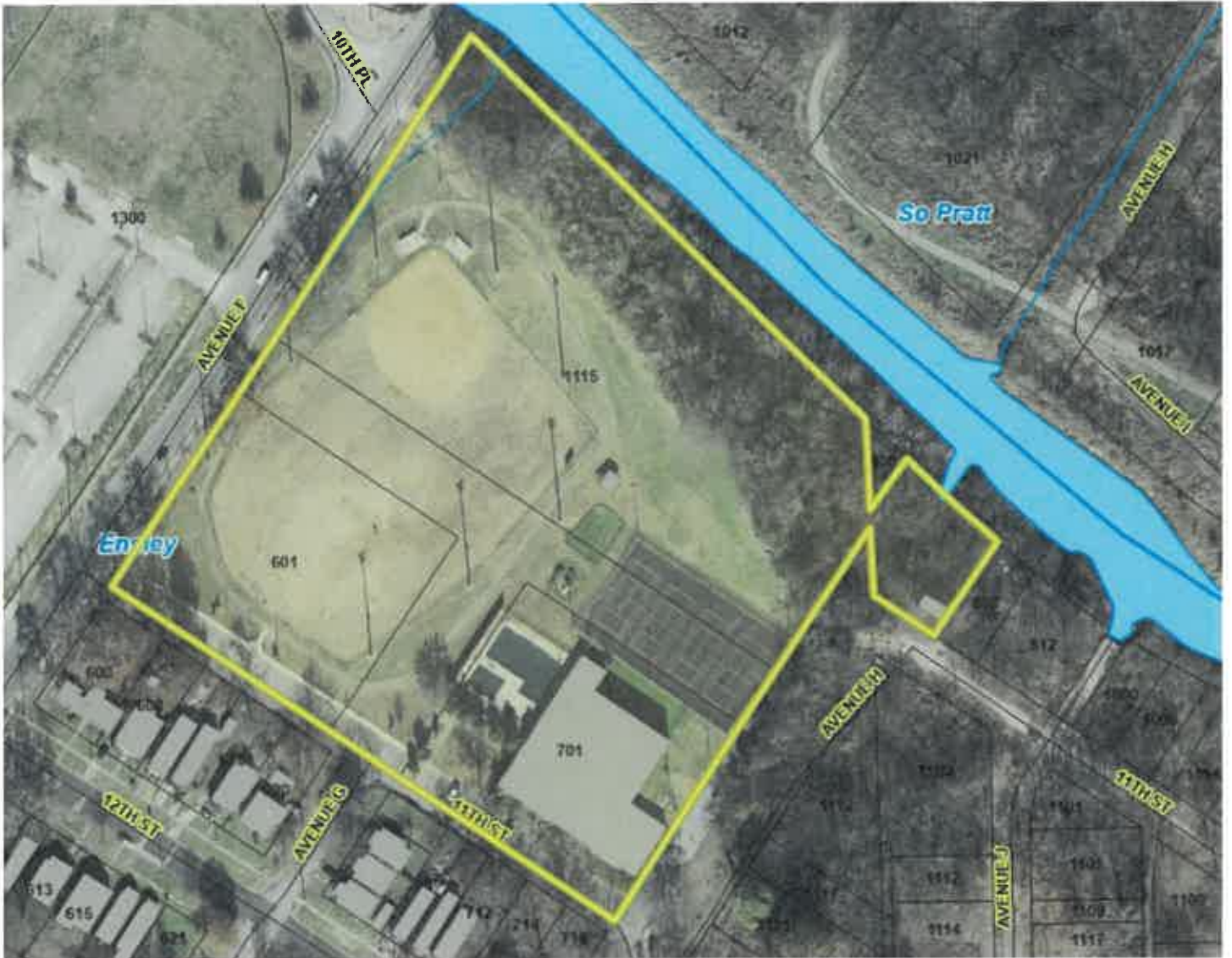
McALPINE PARK (EXCLUDING BALLFIELD)