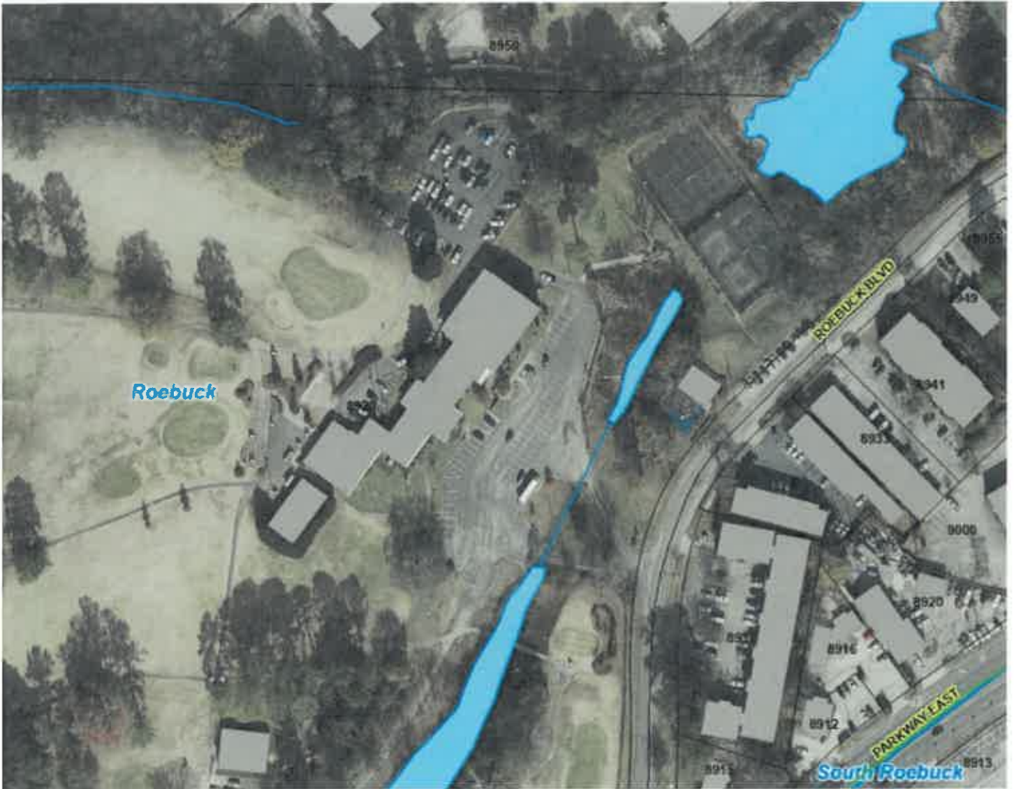
HAWKINS PARK (EXCLUDES THE GOLF COURSE)