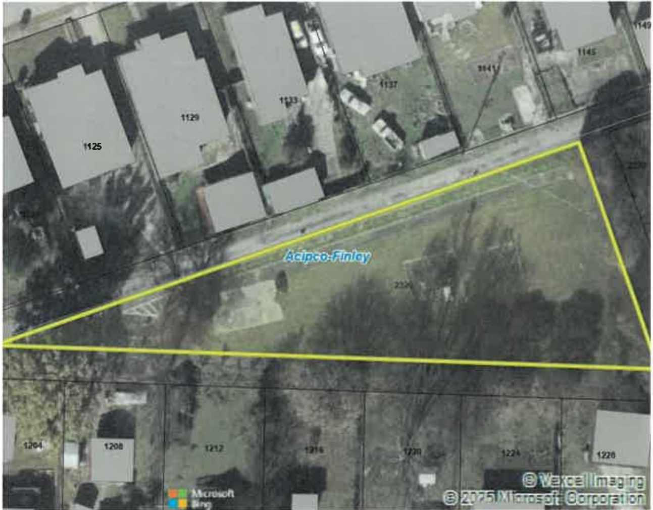
ELLSBERRY PARK VP #37