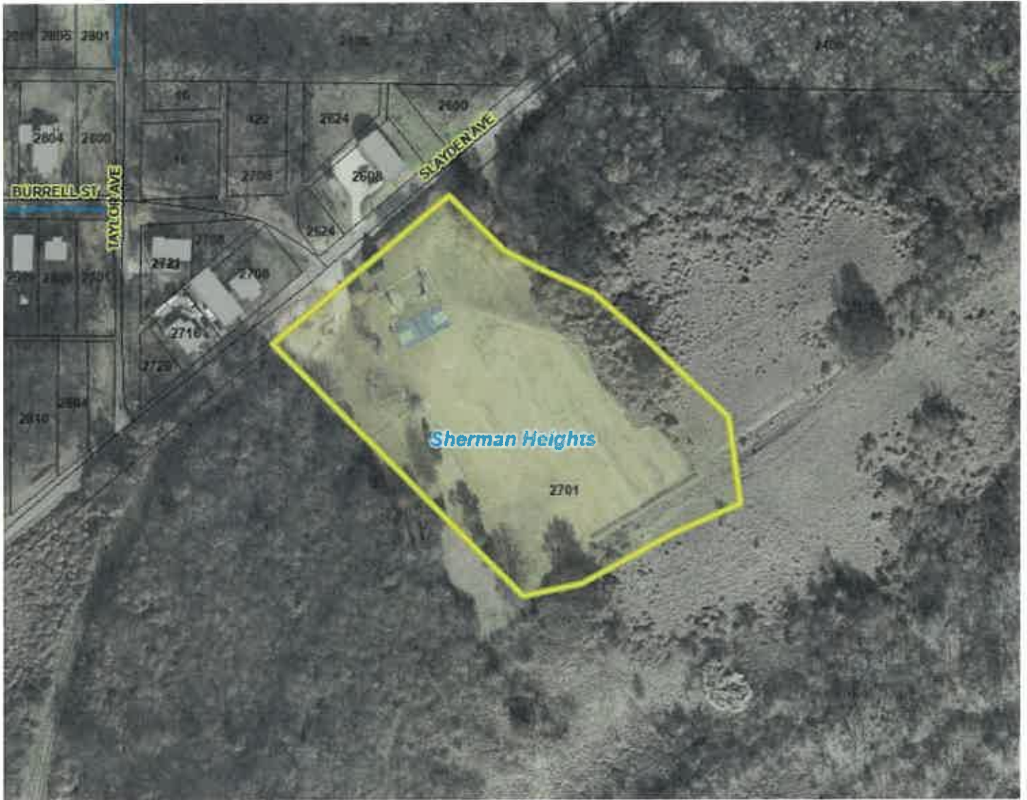
SHERMAN HEIGHTS SOUTH PARK