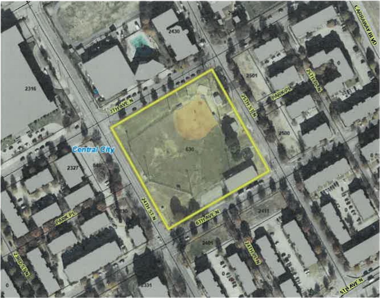
MARCONI PARK (EXCLUDES BALLFIELD)