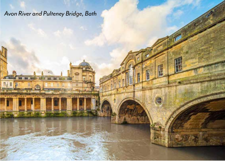
Avon River and Pulteney Bridge, Bath