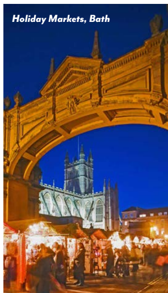
Holiday Markets, Bath