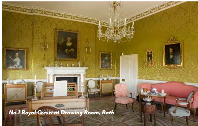
No. 1 Royal Crescent Drawing Room, Bath

En route to Bath, stop at the National Trust Dyrham Park, a 270-acre park with an elegant country house. The rooms sparkle with festive greenery and twinkling lights, creating a warm holiday glow, while outside, a magnificent