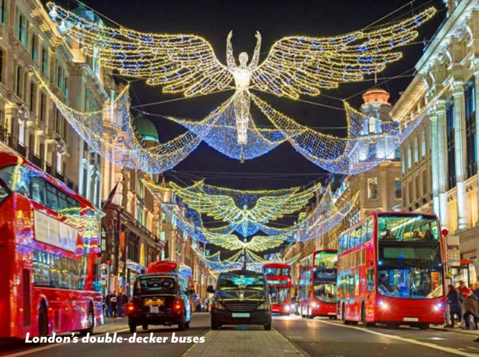
London's double-decker buses