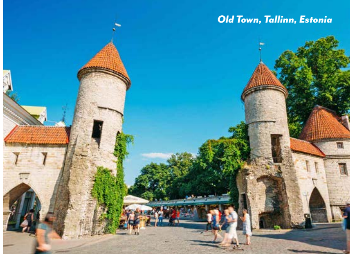
Old Town, Tallinn, Estonia

motorcoach tour of the city's highlights. Pass by the colorful Market Square in the South Harbour and stop to see the modernist Sibelius Monument, an artistic homage to Finland's most famous composer. Visit the subterranean Tempelpiaukio Church (if no church services are in progress) called the "Rock Church," as it was impressively hewn into solid natural bedrock. This afternoon, choose your excursion: visit the charming