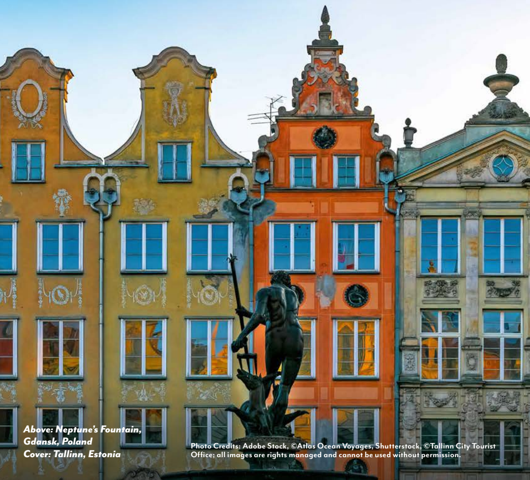
Above: Neptune's Fountain, Gdansk, Poland Cover: Tallinn, Estonia

Photo Credits: Adobe Stock, ©Atlas Ocean Voyages, Shutterstock, ©Tallinn City Tourist Office; all images are rights managed and cannot be used without permission.