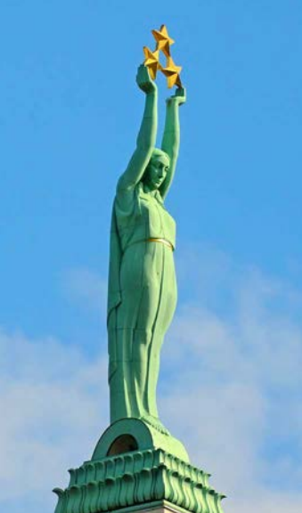
Freedom Monument, Riga, Latvia

motorcoach tour of the city's highlights. Pass by the colorful Market Square in the South Harbour and stop to see the modernist Sibelius Monument, an artistic homage to Finland's most famous composer. Visit the subterranean Tempelpiaukio Church (if no church services are in progress) called the "Rock Church," as it was impressively hewn into solid natural bedrock. This afternoon, choose your excursion: visit the charming