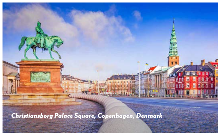
Christiansborg Palace Square, Copenhagen, Denmark

In Kalmar, one of Sweden's oldest cities, choose one of two excursions. With a guide, visit Kalmar Castle, then take