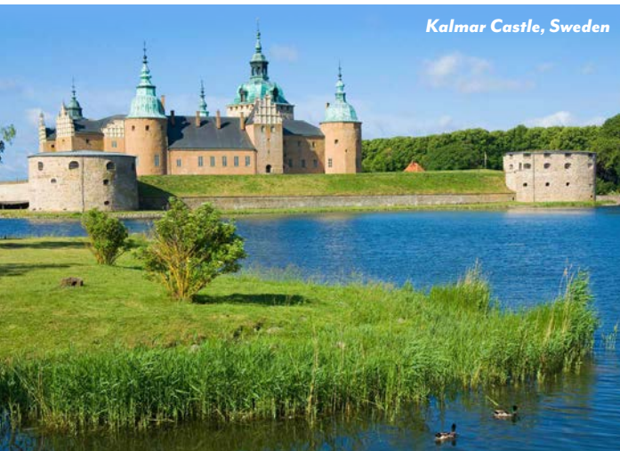
Kalmar Castle, Sweden

Helsinki, the capital of Finland, is also known as “Daughter of the Baltic Sea.” Take a panoramic