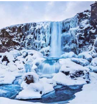
Þingvellir National Park

Following breakfast, depart for an excursion showcasing glistening waters, bubbling mud pots and misty waterfalls. Begin at Lake Mývatn, known for its strange lava formations, geothermal landscapes and incredible birdlife — all concentrated around a shallow, shiny lake formed by a volcanic eruption over 2,000 years ago.