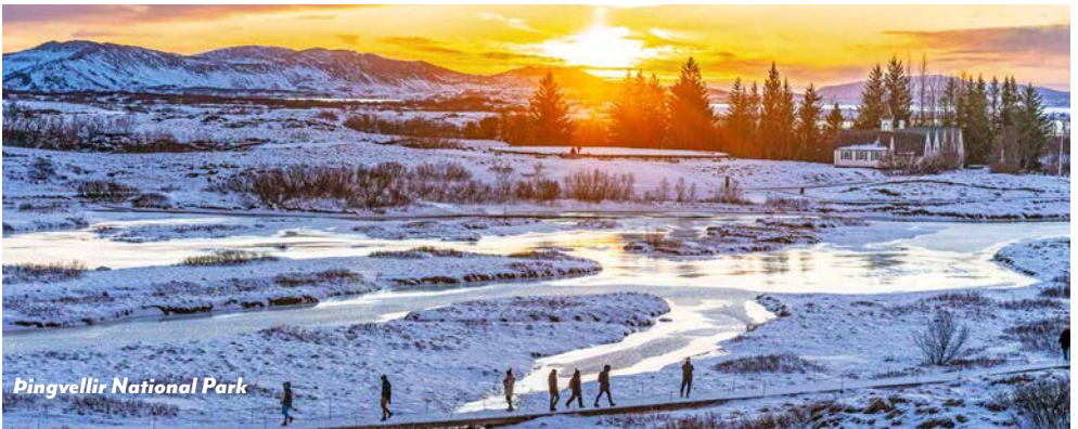
Þingvellir National Park

Whether or not you travel with the NAA, you can make an impact by giving to Northwestern. Make your gift today at giving.nu/NAA-Travel .