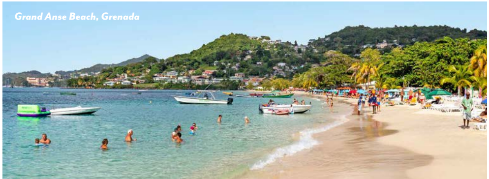
Grand Anse Beach, Grenada

Whether or not you travel with the NAA, you can make an impact by giving to Northwestern. Make your gift today at giving.nu/NAA-Travel .