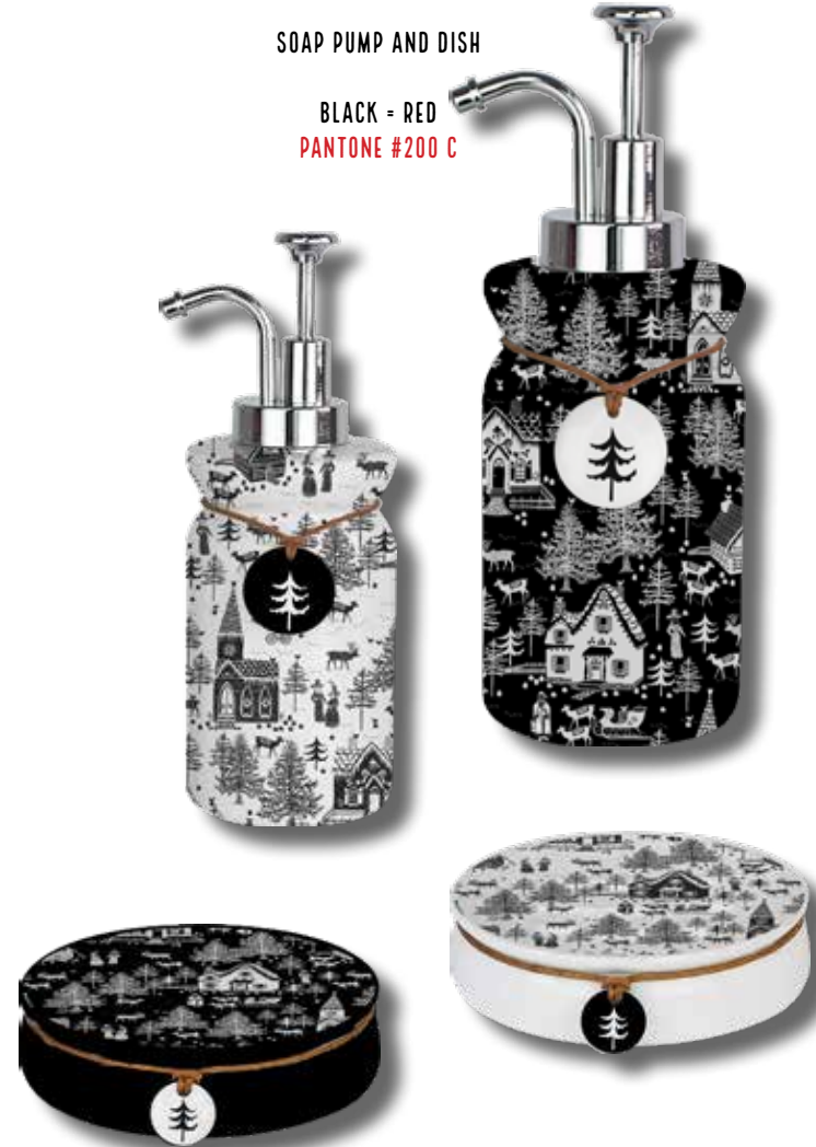
BLACK - RED PANTONE #200 C