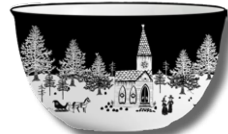
CERAMIC NESTING BOWLS