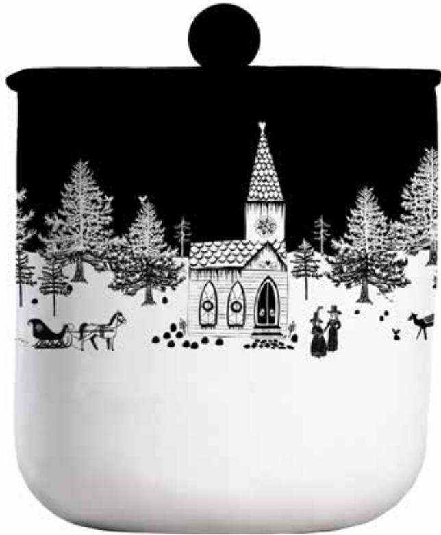
CANISTERS BLACK - RED PANTONE #200 C