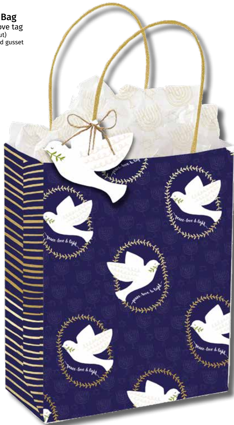
Gift Bag w/Dove tag (die cut) Striped gusset