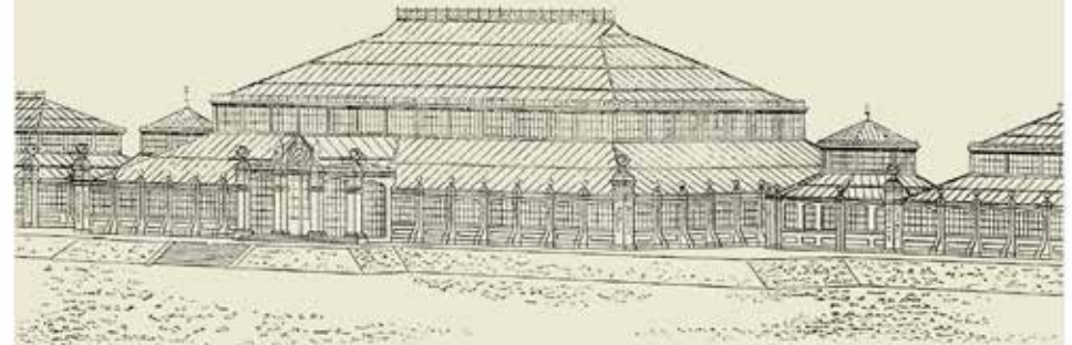
The Great Temperate House in the Royal Gardens, Kew