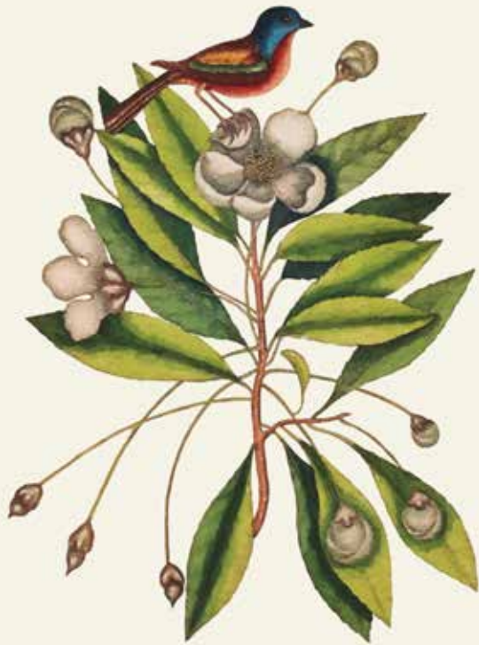
The Painted Finch