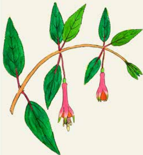
Fuchsia a. Purpurea