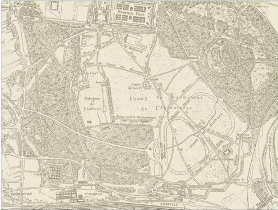
Plan of the Park of Stourhead, France