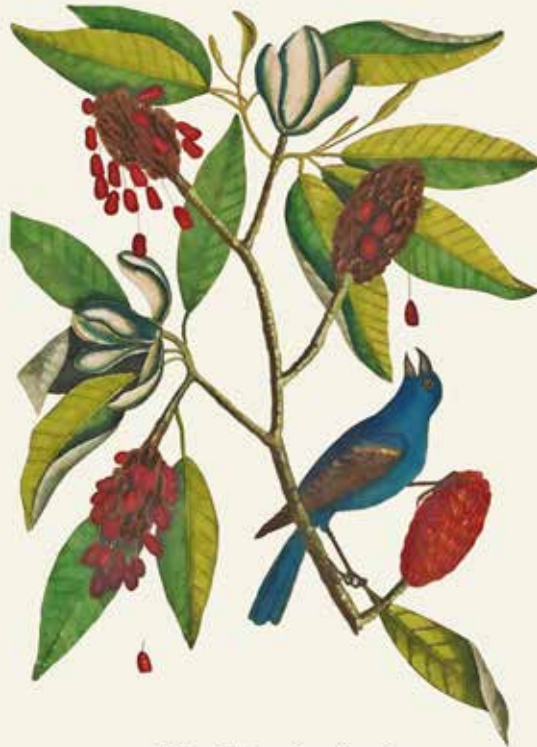
The Blue Grosbeak