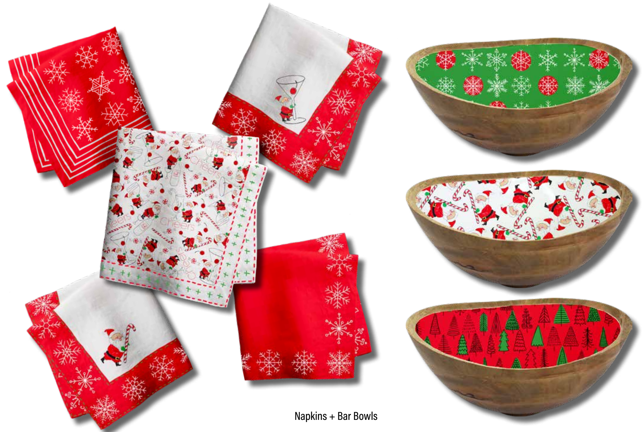
Napkins + Bar Bowls