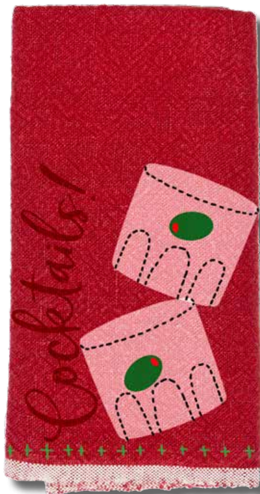
Bar towel idea... silkscreened - glasses, olives and type black + green line to be stitched