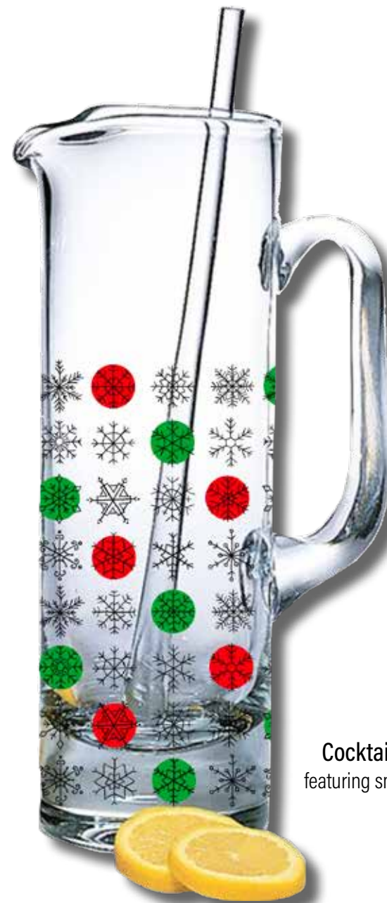
Cocktail Pitcher... featuring snowflake motif