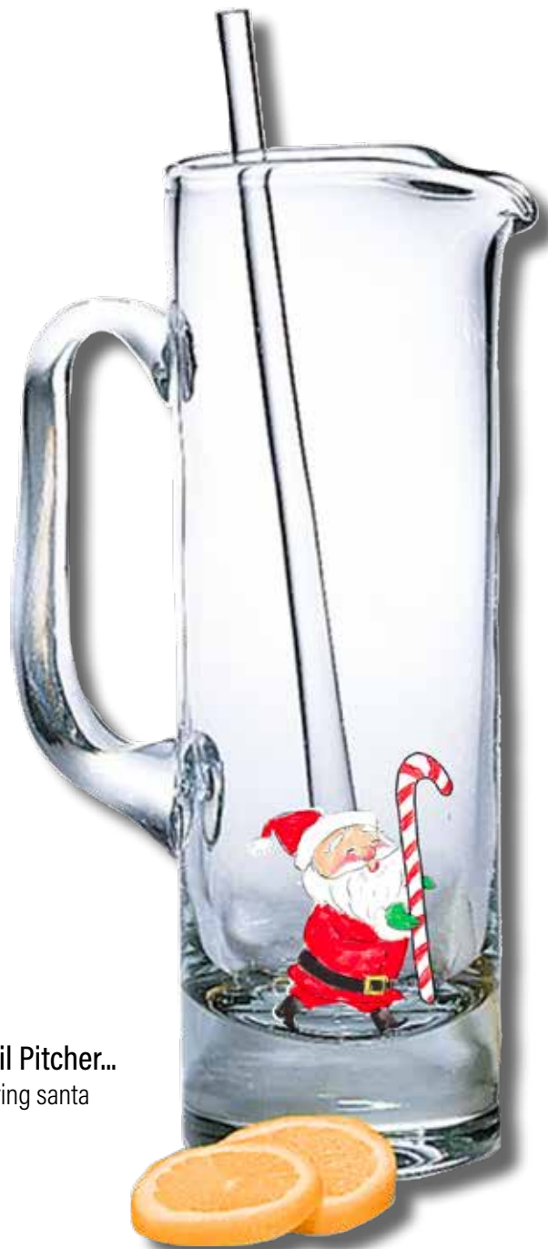
Cocktail Pitcher... featuring santa