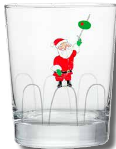
Double Old Fashioned... glasses featuring santas