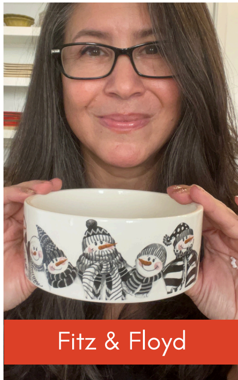
Fitz & Floyd