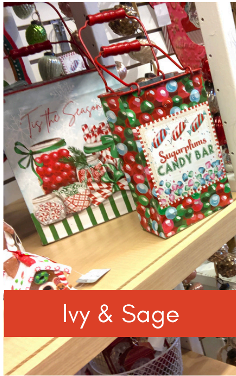
Ivy & Sage