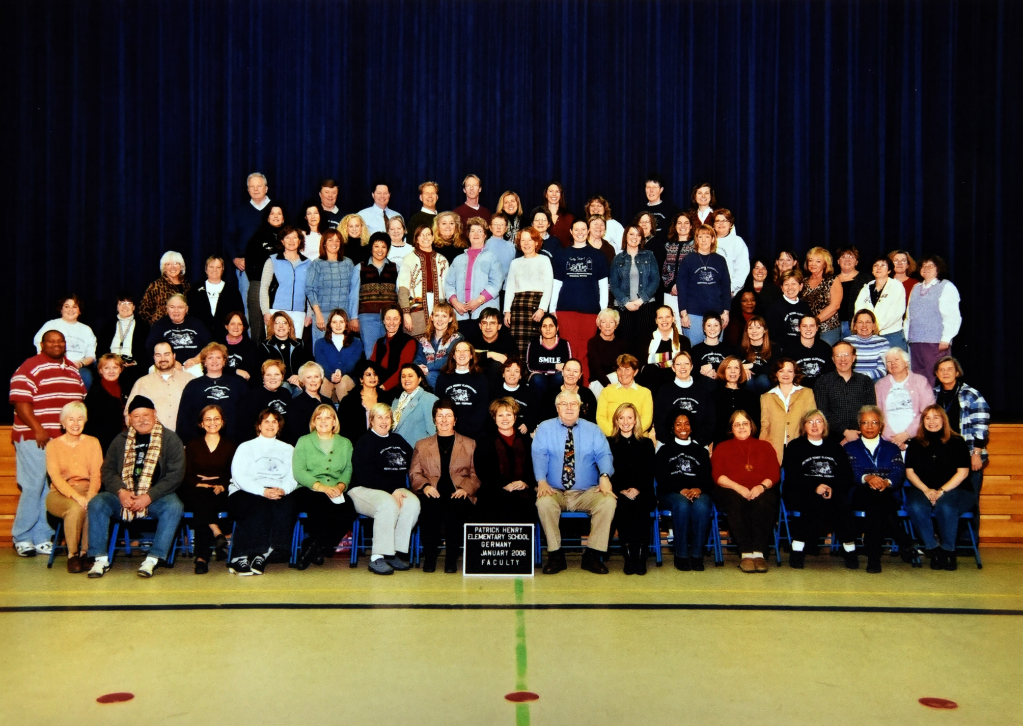
PATRICK HENRY ELEMENTARY SCHOOL GERMANY JANUARY 2006 FACULTY