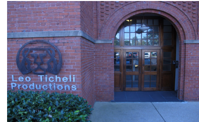
LTP main entrance