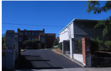
Building from 29th St. S.