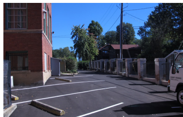
Rental Parking Area