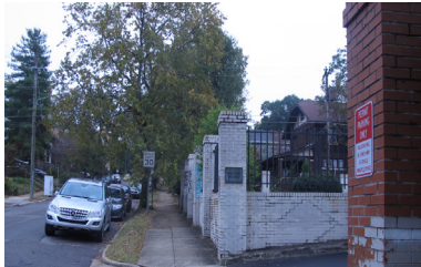
29th St. South entrance

Leo Ticheli Productions' entrance is off 29th Street South. We are in the rear of the Martin Advertising building which faces University Blvd.