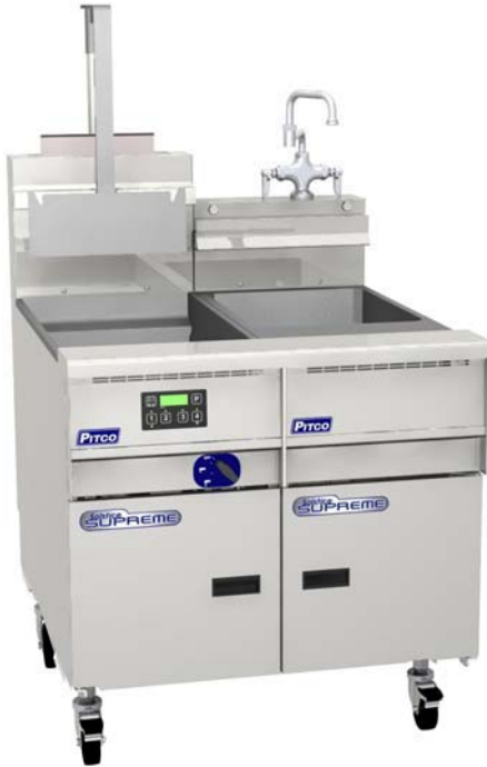
Model SSPG14/SSRS14 Shown with optional: Casters, Single Basket Lift