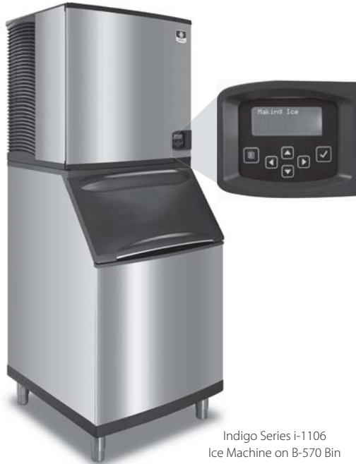
Indigo Series i-1106 Ice Machine on B-570 Bin

Designed for operators who know that ice is critical to their business, the Indigo™ Series ice machine's preventative diagnostics continually monitor itself for reliable ice production. Improvements in cleanability and programmability make your ice machine easy to own and less expensive to operate.