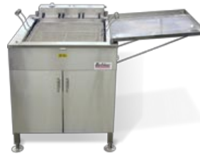
624 electric fryer (24" x 24")