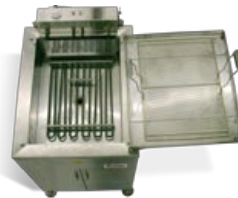
618L electric fryer (18" x 26")