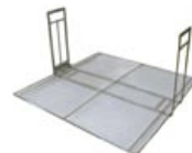
Screen cradle and proofing screen. The best way to transfer raised donuts from proofer to fryer.