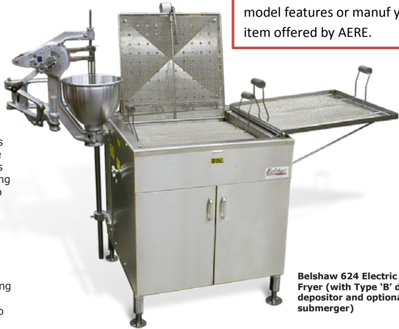
Belshaw 624 Electric Fryer (with Type 'B' donut depositor and optional submerger)

FOR GENERAL REFERENCE ONLY Models shown may not match the model features or manuf year of the item offered by AERE.