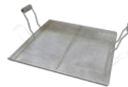
Frying screen (identical to proofing screen, but has bolt-on handles). Screens are reinforced wire mesh, spaced 1/4" (6mm) apart, manufactured from nickel-plated steel.