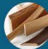
SignatureFlex Flexible Moldings