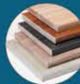
SignatureEdge Stair Treads